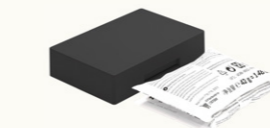
Ethylene absorber ACLETHST10