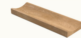
Bottle support RVA 438 040