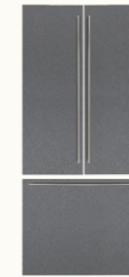
Door panels RVA 421 922

Dark brushed stainless steel, handleless