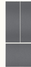
Door panels RVA 428 922

Dark brushed stainless steel, handleless